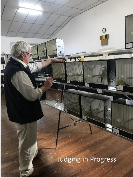
Judging in Progress