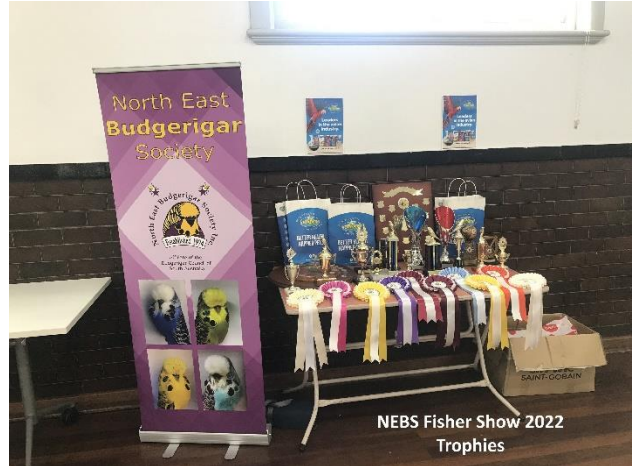
NEBS Fisher Show 2022 Trophies