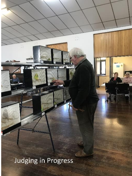
Judging in Progress