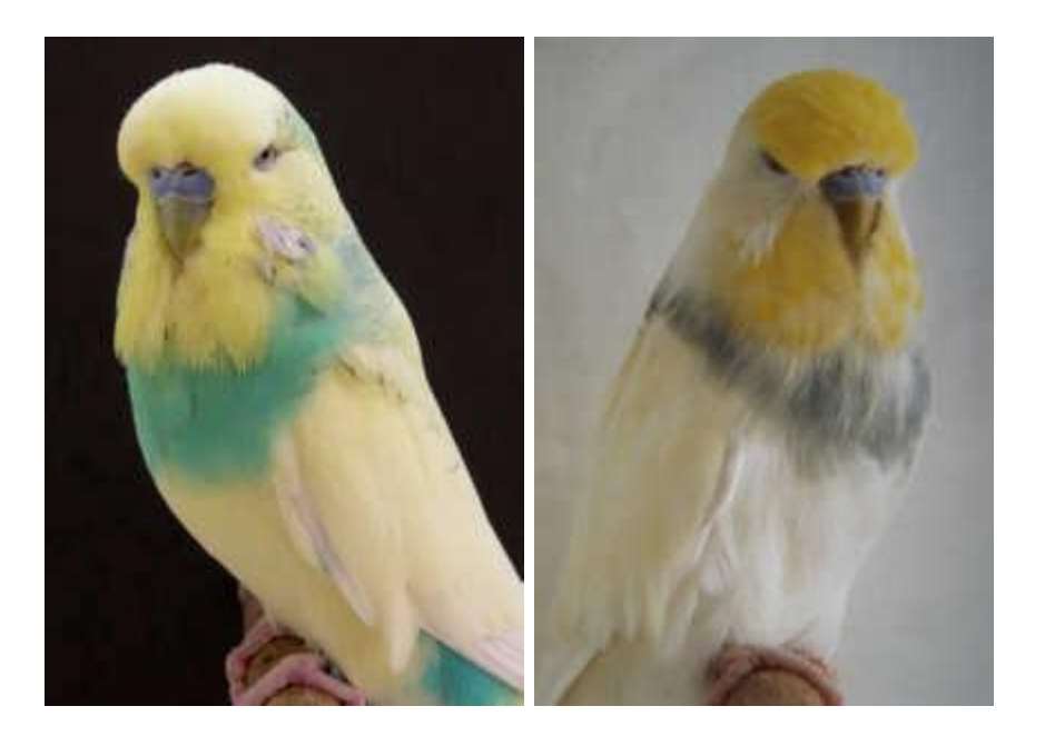
Needless to say, there are a lot of pet-birds as well.

The other is "Show Budgerigars", which are called "English Budgerigars" or "Big sized Budgerigars". The breeding history of this type of Budgerigars goes back about 40 years and is more intense.