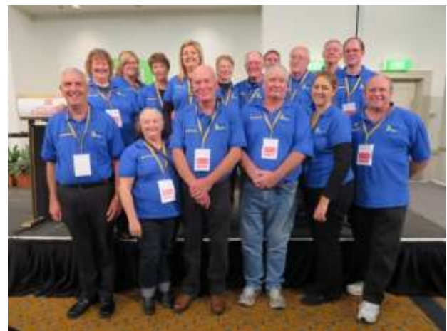
4. Stewards Team