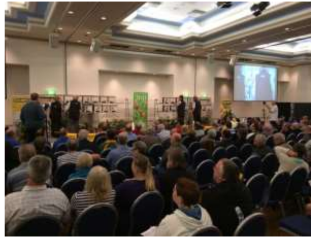
2. Judging in progress