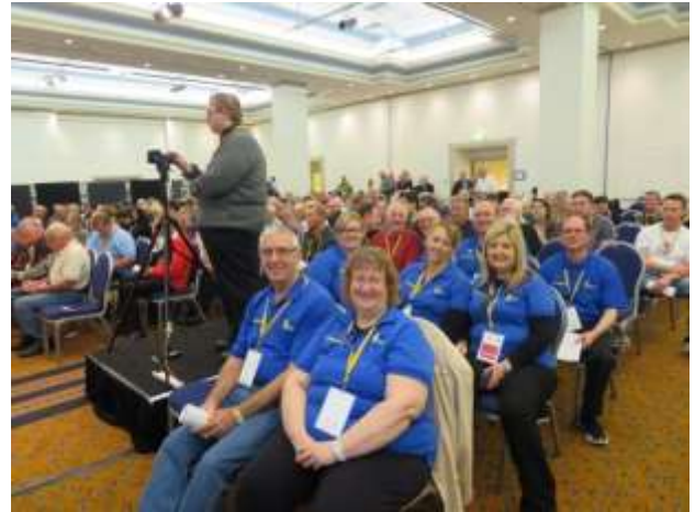
6. Stewards Team B