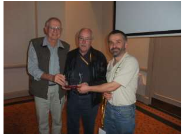
10. Winners are gridders