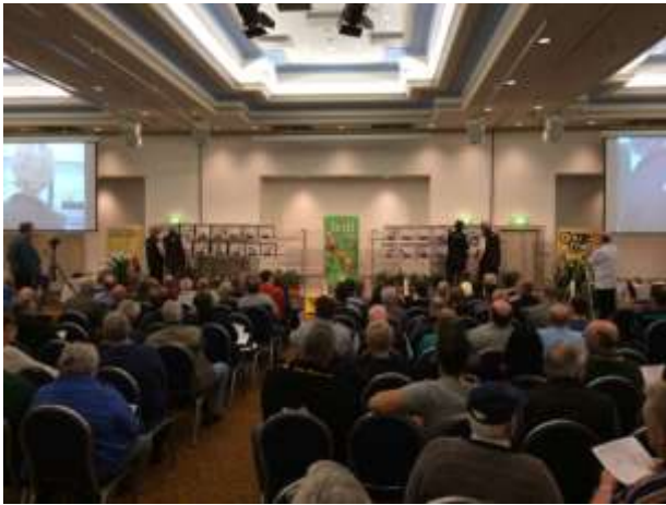
1. Judging in progress

Photo Gallery: Photos Nos. 4. to 9.