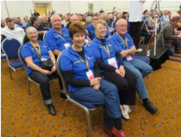
5. Stewards Team A