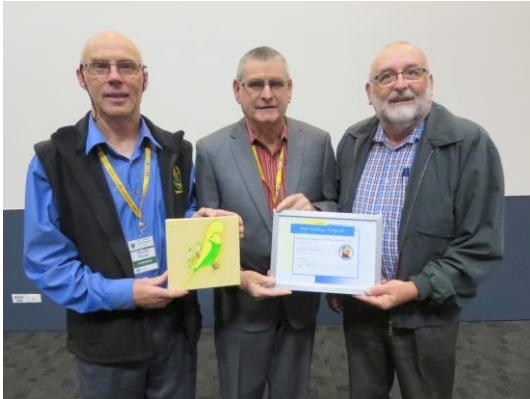
This could be you